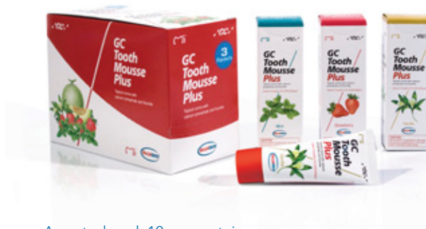
Assorted pack 10pcs contains: 4 x Mint, 4 x Strawberry, 2 x Vanilla

GC Tooth Mousse Plus comes in individual 40g tubes in a variety of delicious flavours.