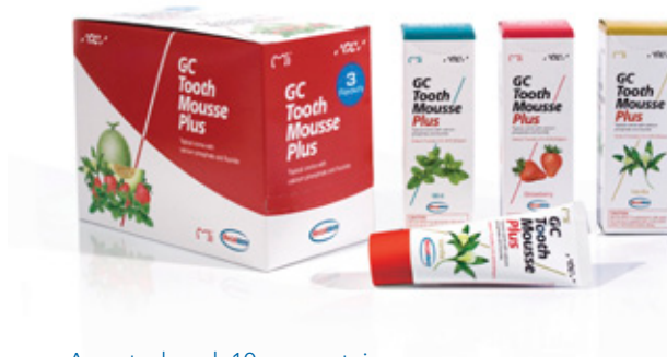
Assorted pack 10pcs contains: 4 x Mint, 4 x Strawberry, 2 x Vanilla

GC Tooth Mousse Plus comes in individual 40g tubes in a variety of delicious flavours.